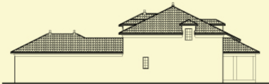
E4 RIGHT ELEVATION