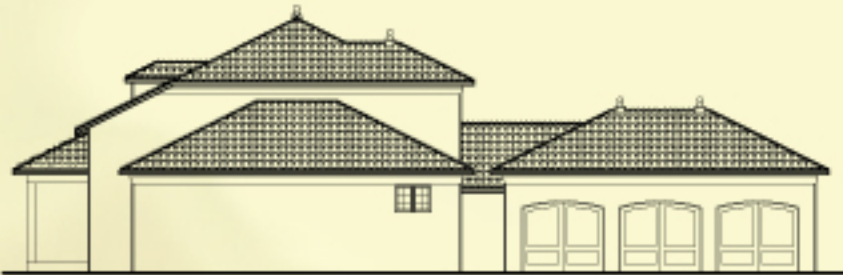
E2 LEFT ELEVATION