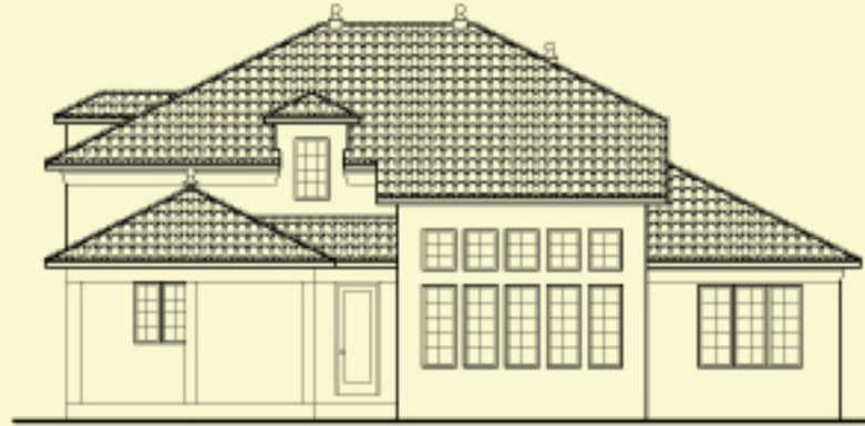
E3 REAR ELEVATION