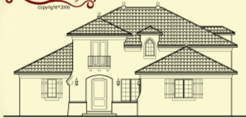
E1 FRONT ELEVATION