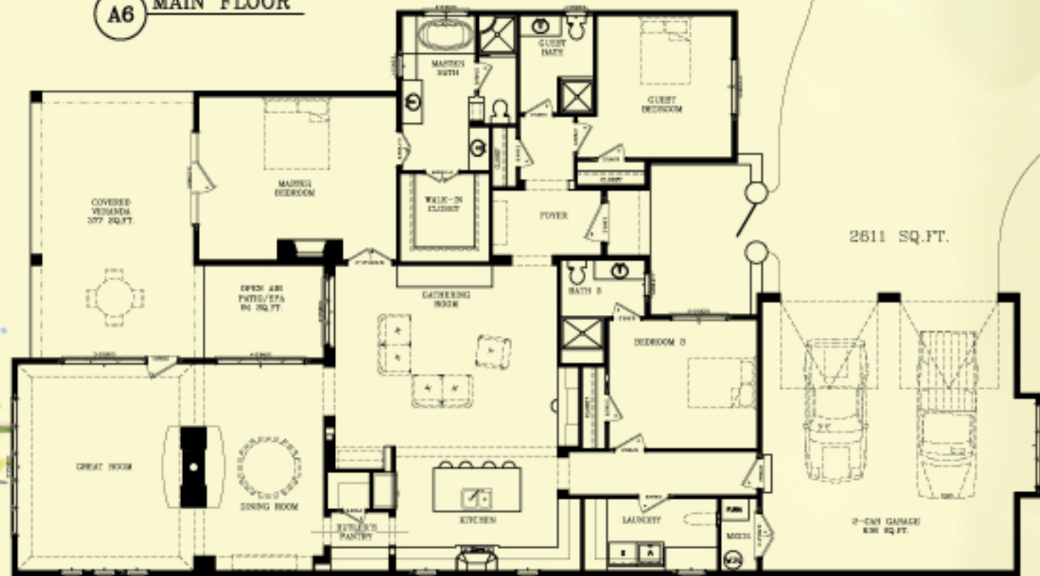
A6 MAIN FLOOR