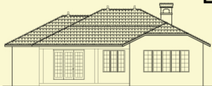
E3 REAR ELEVATION