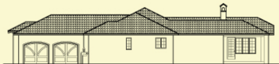
E4 RIGHT ELEVATION