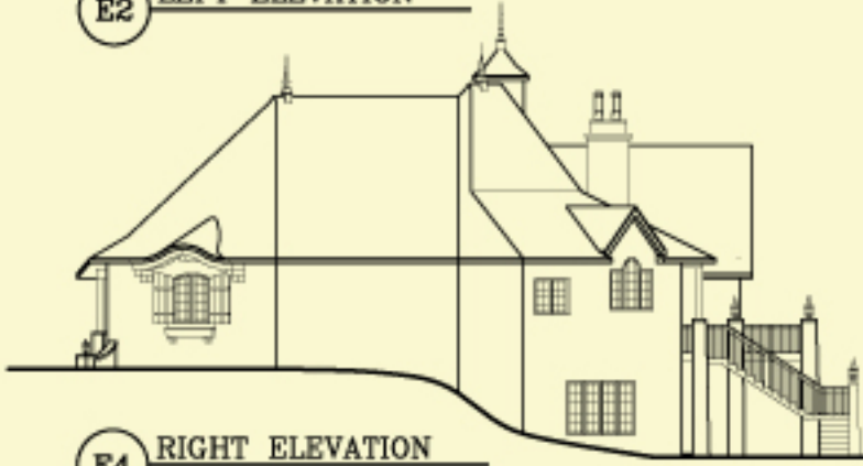
E4 RIGHT ELEVATION