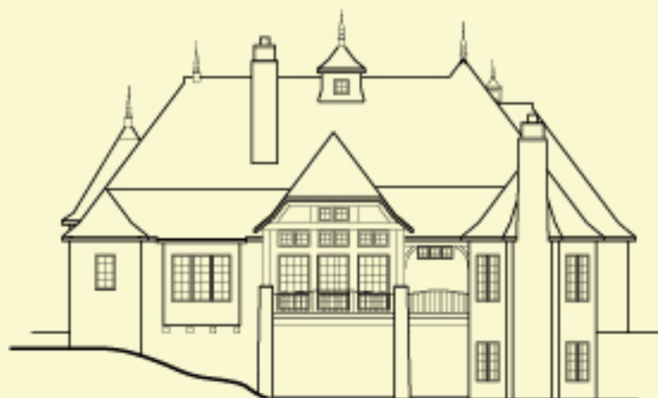
E3 REAR ELEVATION