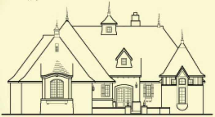
E1 FRONT ELEVATION