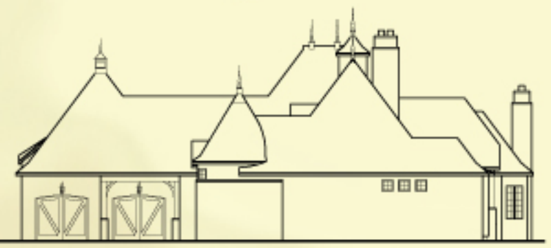
E2 RIGHT ELEVATION