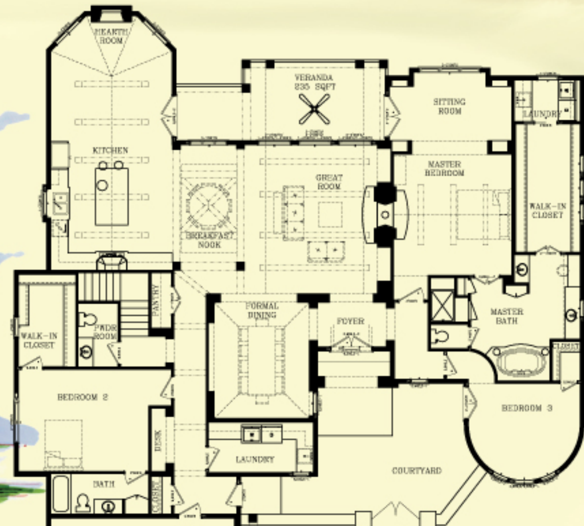
A6 MAIN FLOOR