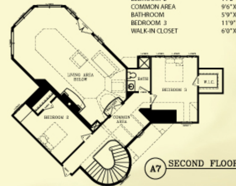
A7 SECOND FLOOR