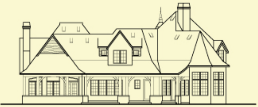
E3 REAR ELEVATION