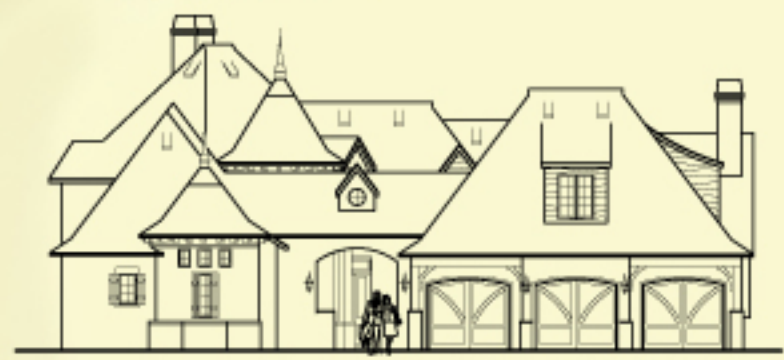
E1 FRONT ELEVATION