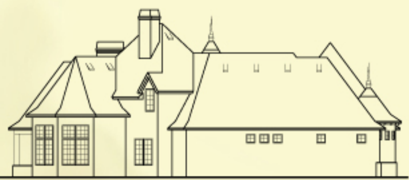
E2 LEFT ELEVATION