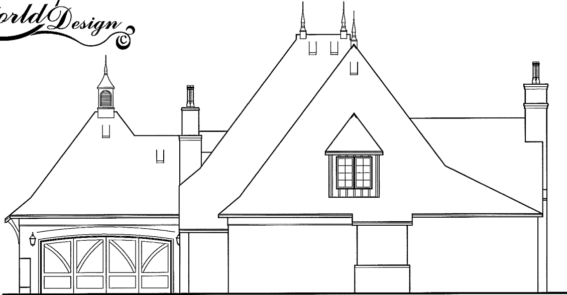
E4 RIGHT ELEVATION