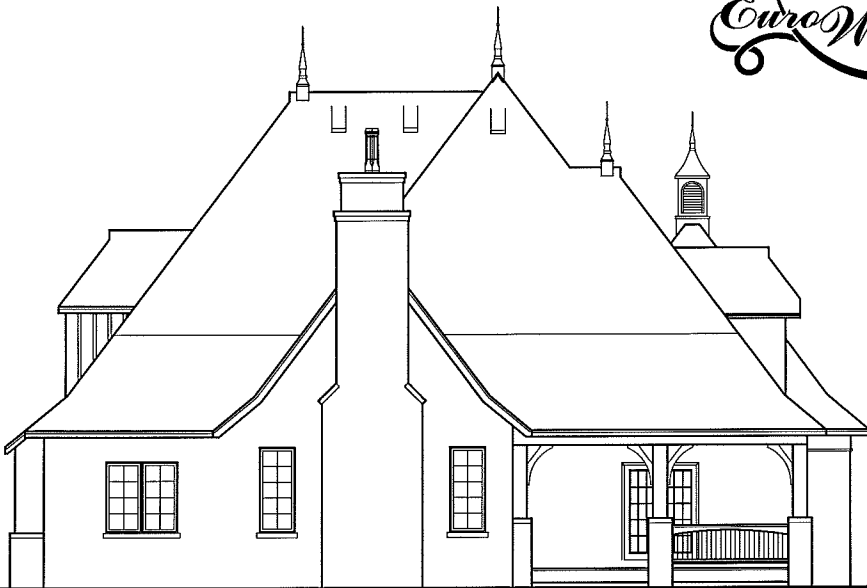
E3 REAR ELEVATION