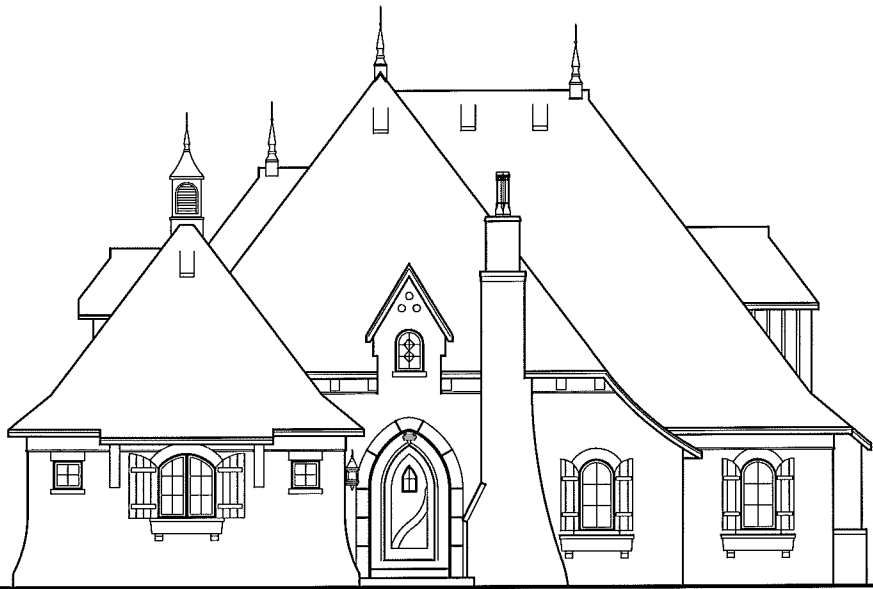
E1 FRONT ELEVATION