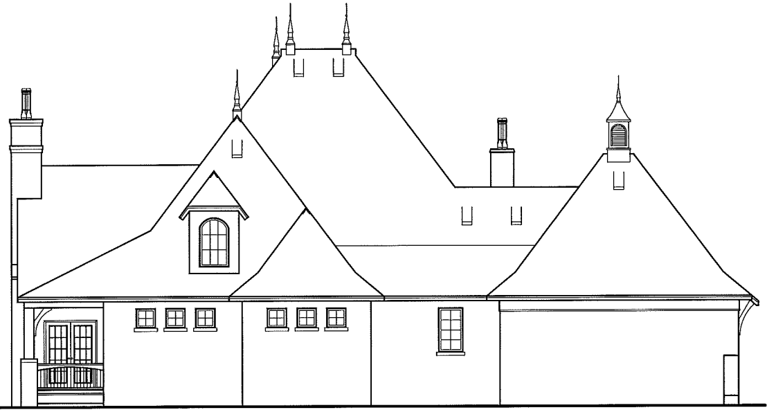
E2 LEFT ELEVATION