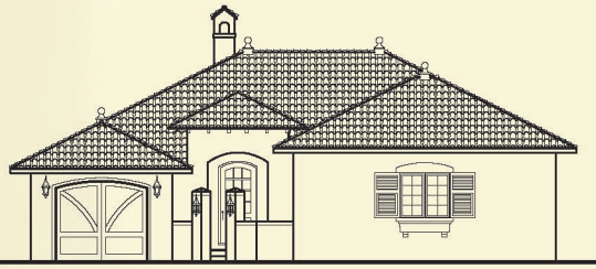
E1 FRONT ELEVATION