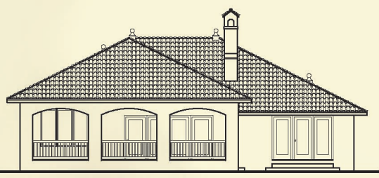
E3 REAR ELEVATION