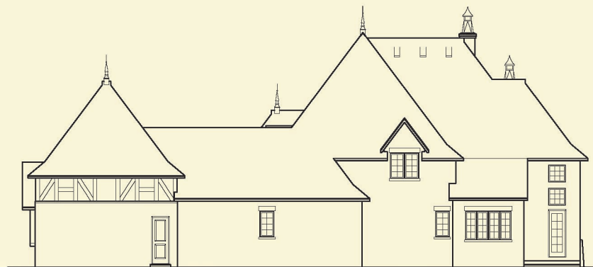
E4 RIGHT ELEVATION