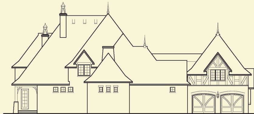
E2 LEFT ELEVATION