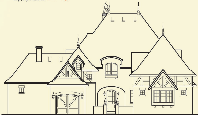
E1 FRONT ELEVATION