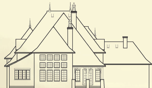
E3 REAR ELEVATION